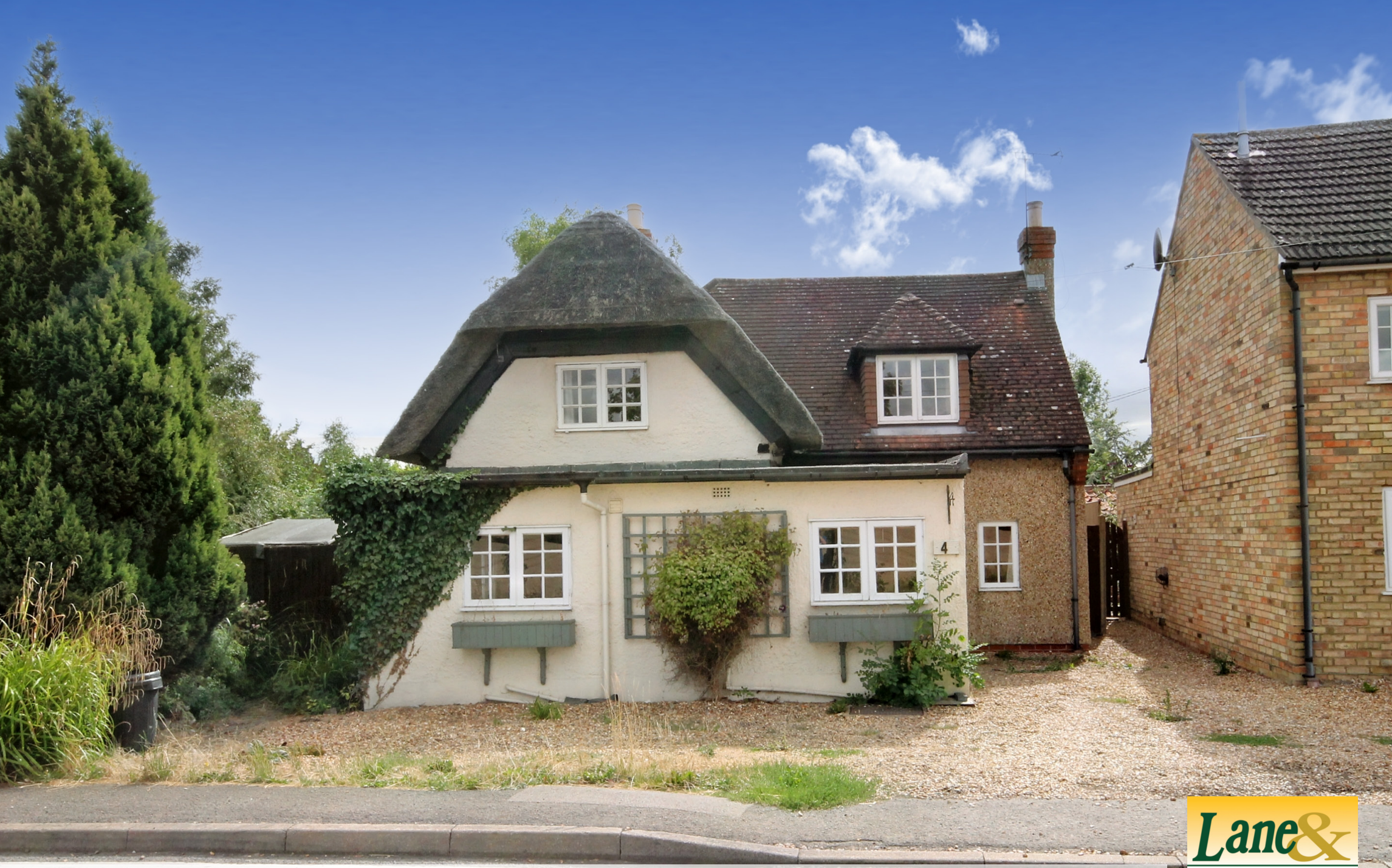
Little Thatch, 4 Oldways Road, Ravensden, Bedford MK44 2RD